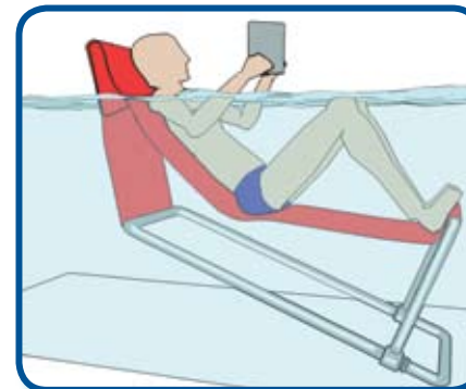
Sea Hammock in the sitting up position

Sea-Hammock's plastic frame is comprised of pvc tubes. The frame can be assembled or broken apart by a few blows with the palm of your hand. Sea-Hammock's aluminium frame is comprised of 3 'U' shaped tubes and 2 joints held together by 4 'C' shaped clips. Both versions are supplied with carry bags to make them totally portable.